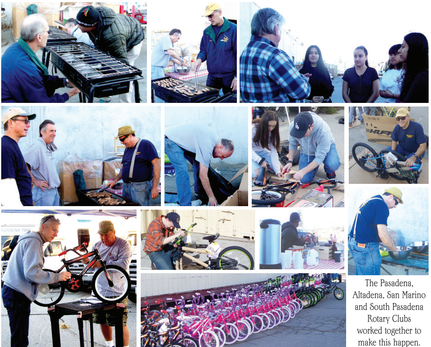
The Pasadena, Altadena, San Marino and South Pasadena Rotary Clubs worked together to make this happen.