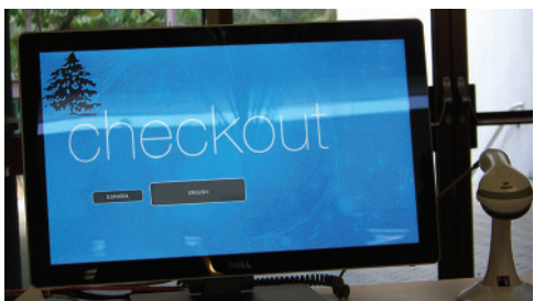
Top Right - Low Water Garden Area. We will be adding trash cans and benches. Native California plants will be added. •• Middle Right - More room is needed to process the books donated to the Friends of the Library. •• Bottom Right - One portion of our tour. •• Top Left - Children's Area. Just a few of the toys available in the Children's Area. Many books are also available. •• Lower Left - Self Check-Out is now available. More on p. 6.