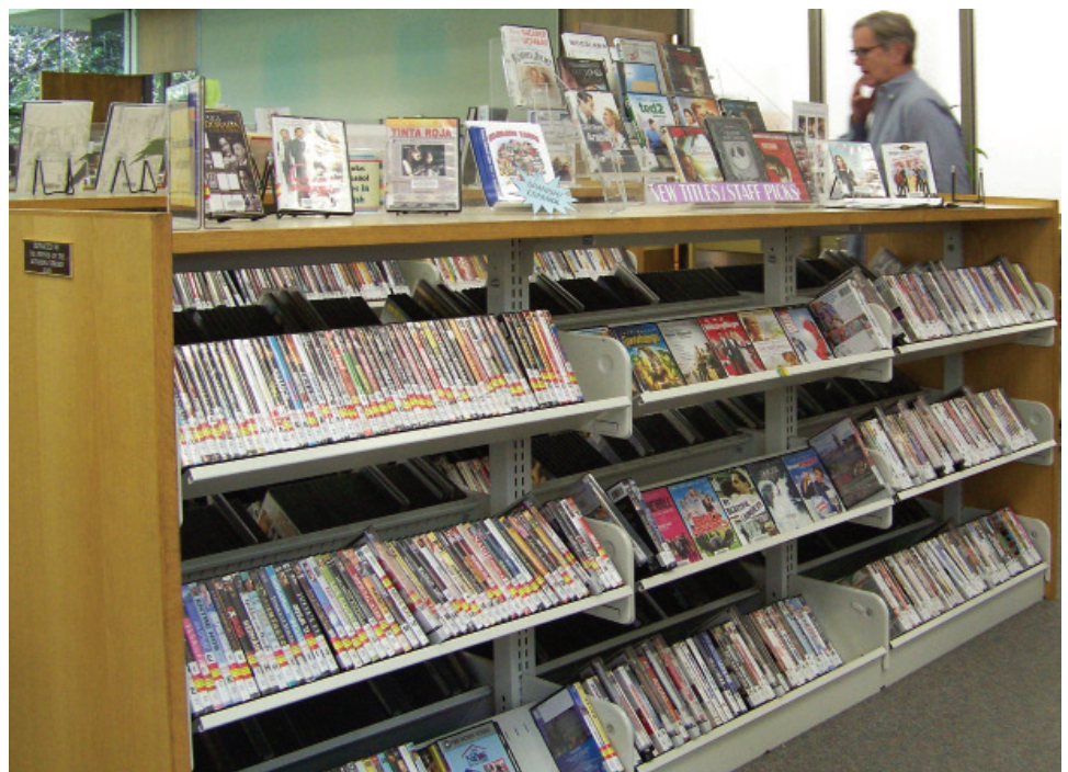
Top Right - The making of the plan of when and what to change and add to make the Altadena Library an even better servant to the community •• Middle Right - The new Reference Section, a lot of which is digital •• Lower Right - The new Borrow a Movie section with a much improved selection and multiple copies of some •• Top Two Left - More from the Children's part of the Library — a very welcoming area that encourages children to love coming to the Library and form the habit of their future •• Third on the Left - The Friends of the Library are getting ready for their big sale this month •• Lower Left - Our members over look the garden area.