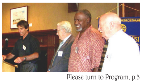
Please turn to Program, p.3

Sparks is published 48 weeks a year and is the official publication of the Rotary Club of Altadena. The deadline for submission of articles is Friday at 6p to current editor email, fax, or delivery.