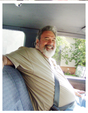
Saturday, May 26, 2012