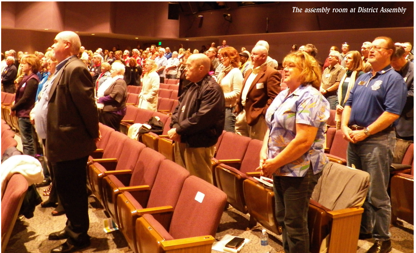
The assembly room at District Assembly

principal heard our presentation. 'I have 25-minute periods on Tuesdays and Thursdays. Please turn to Big Thing, p. 8