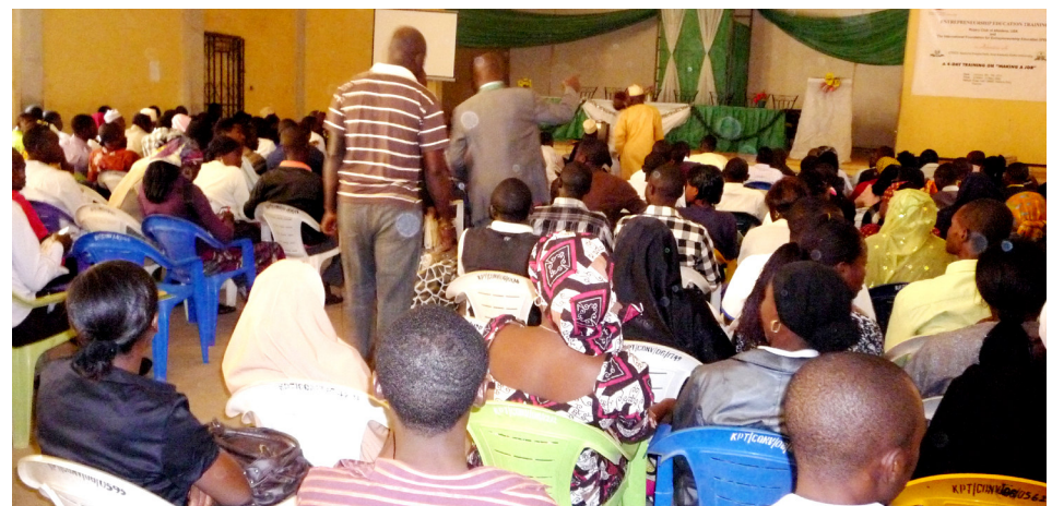
January 2011 - Nigeria classroom from the back