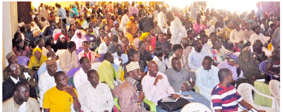
January 2011 - Nigeria classroom from the front

Replicated by Rotarians in many countries, this Job Creation & Entrepreneurship Education can make a major impact on joblessness around the world. ☉