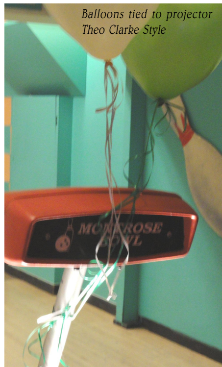
Balloons tied to projector Theo Clarke Style