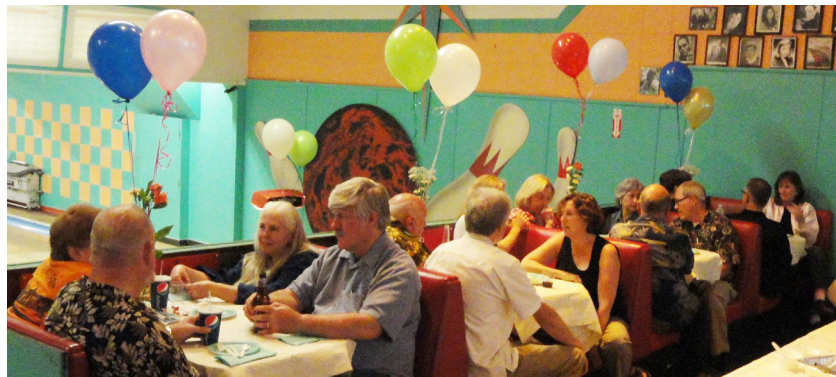
Demotion Party Dinner at Montrose Bowl