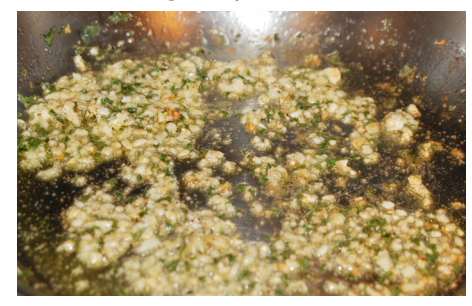
salt, and black pepper. After 30 seconds toss in the beans.

two tablespoons of oil, along with a pinch each of dried parsley, cumin, cinnamon,