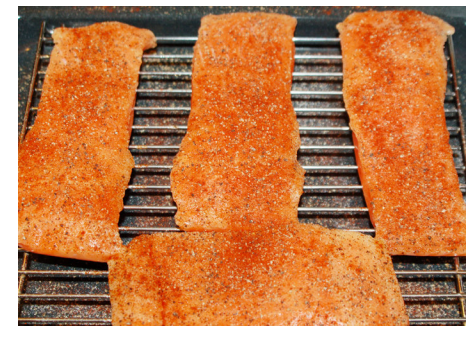
and black pepper on each.

Add half a cup of water to the pan but don't let the water touch the fish. Transfer