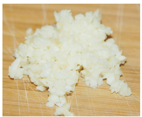
Chop up four heads of garlic. And drain one 15 ounce can of butter

For this particular dinner, we wanted something fast but not boring. This one is quick and sure to please everyone. Even the kids devoured this. First heat up the oven to 500 degrees F. If you have convection oven, use it. Then while the oven heats up,