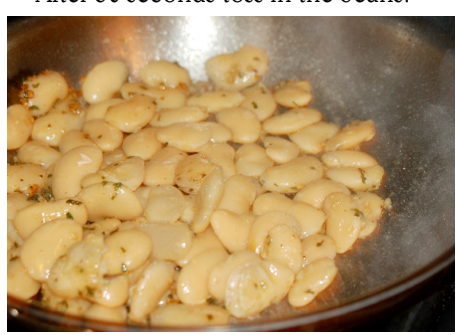
Saute for 30 more seconds.