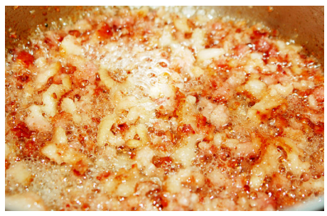
the bacon bits are crisp. Drain and set aside.