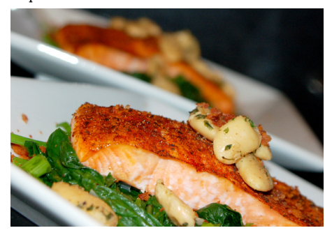
Plate up by placing the spinach on the plate, then the green onions, then the fish. Top the fish with the cold beans and the