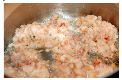
Transfer to saucepan, and heat until