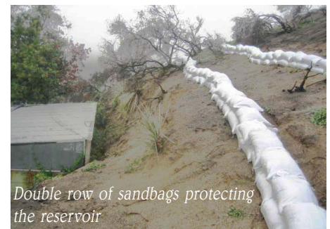
Double row of sandbags protecting the reservoir