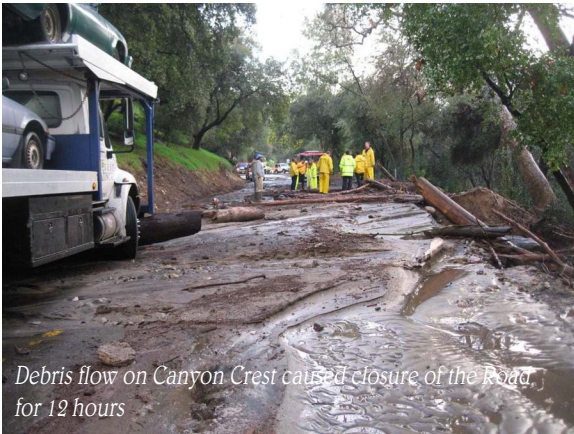
Debris flow on Canyon Crest caused closure of the road for 12 hours