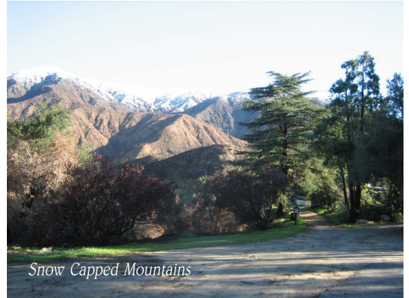
Snow Capped Mountains

drive up and down every day. Things were a mess. And the rain kept falling.