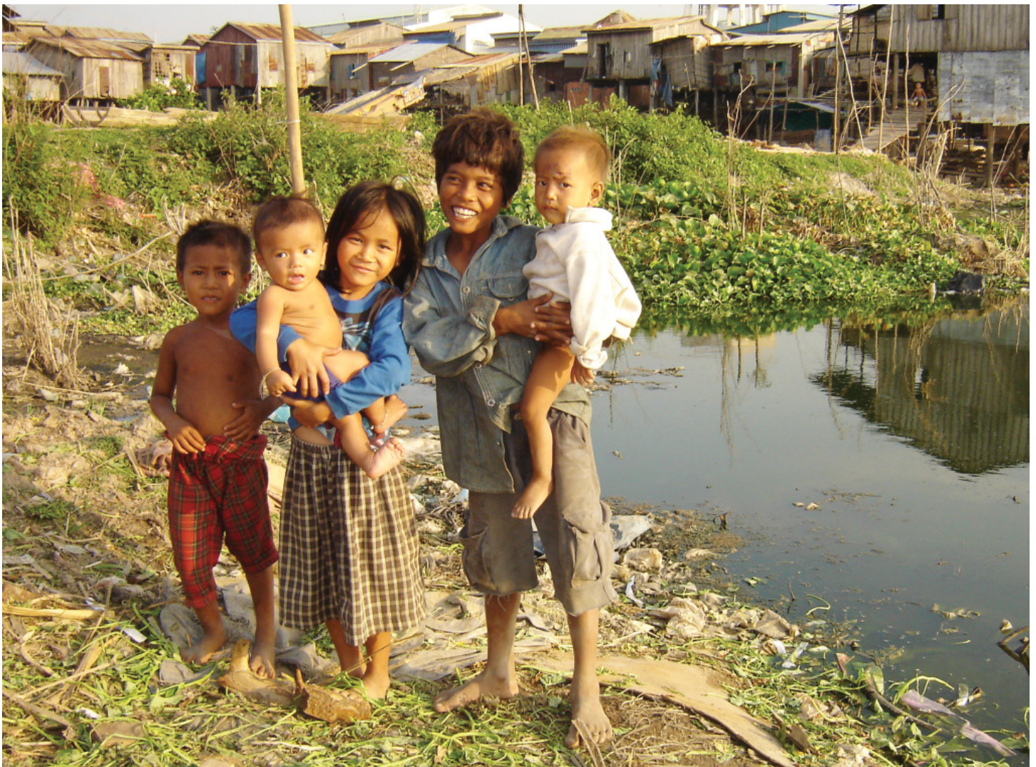
Local Family standing beside a Water Hole