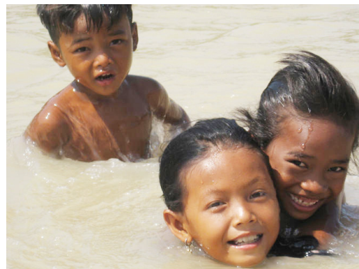
Children Playing in a Water Hole

This week Smith and I were in touch with Bill Morse in Siem Reap, Cambodia regarding the transfer of funds from our Club. Morse set up a de-mining organization many years ago – training local workers to clear their villages of