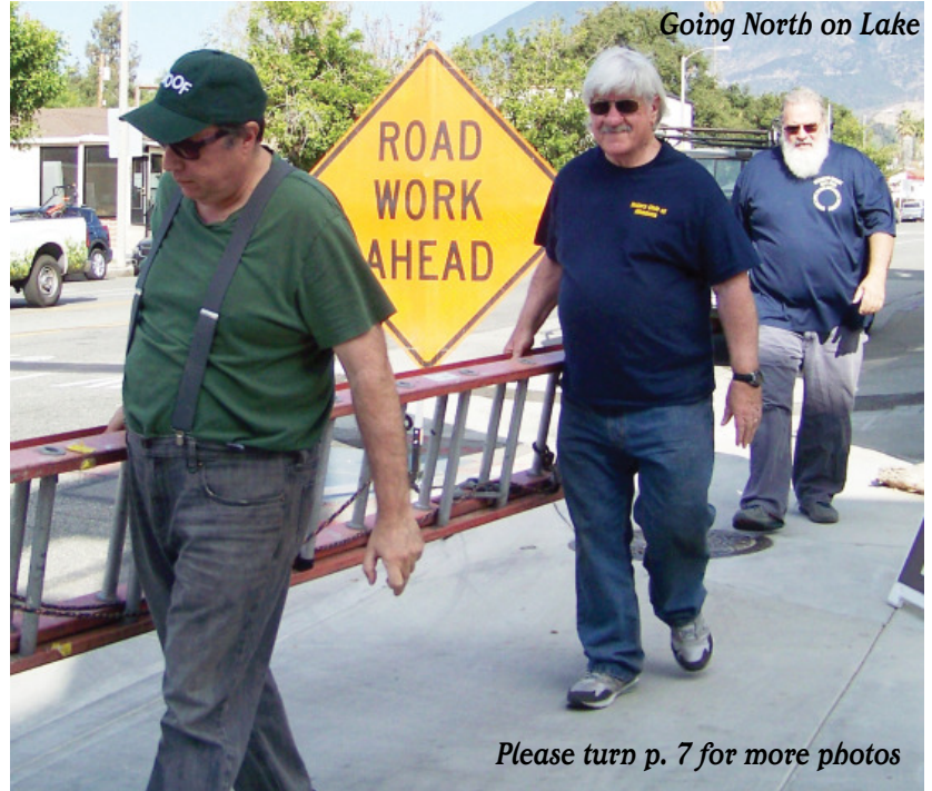
Please turn p. 7 for more photos