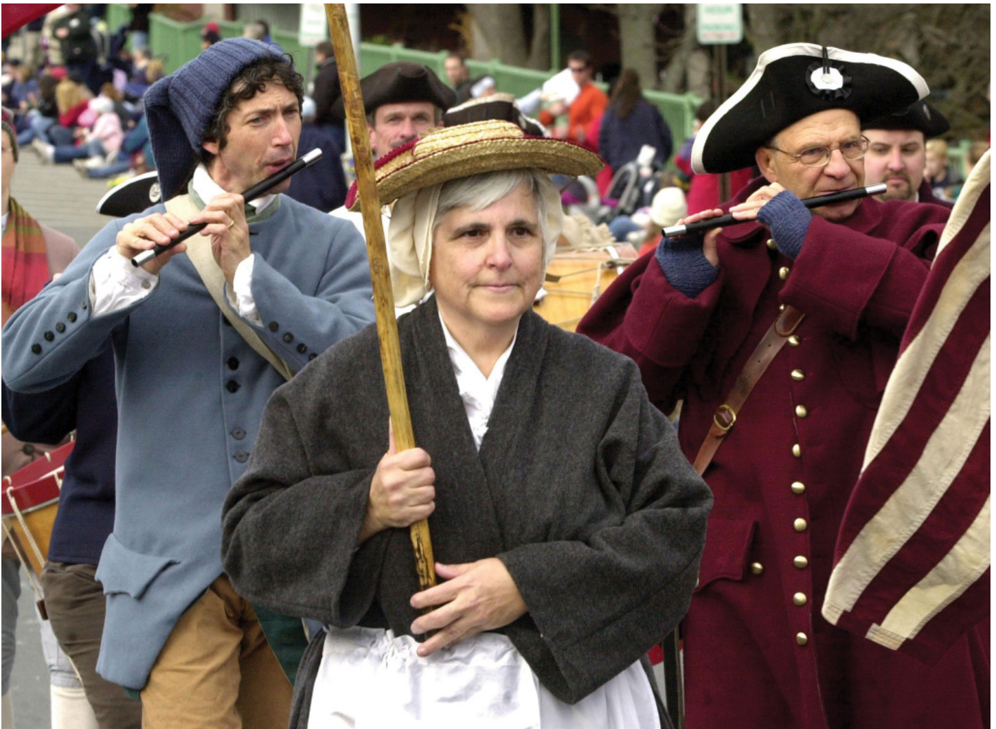
Thanksgiving Pilgrims ... Members of a colonial fife and drums corps are pictured marching in the annual Thanksgiving Parade on November 20, 2004 in Plymouth, Massachusetts.

The parade is a part of a weekend of holiday festivities called “America’s Hometown Celebration,” and commemorates the Plymouth Colony’s first Thanksgiving feast of 1621.