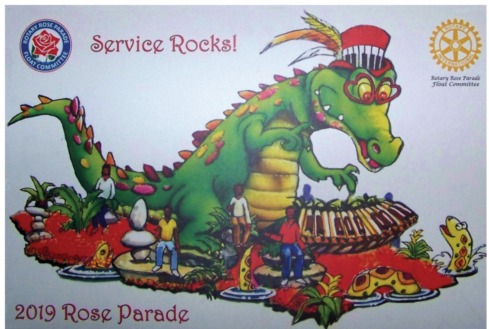
Artist's rendering of the Rotary International Float for the 2019 Rose Parade