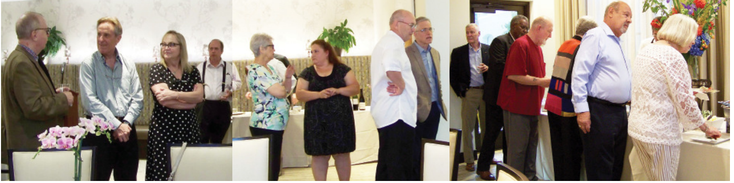
The Play's The Thing . . .