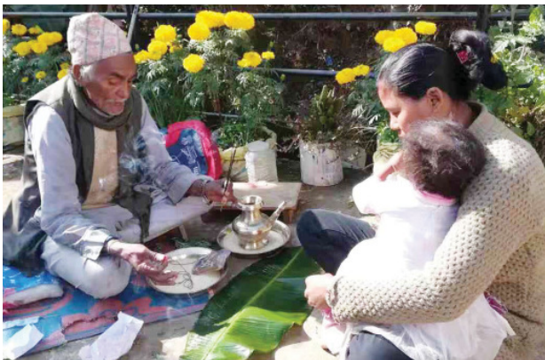
Child and Mother sit with the Shaman who is working to evoke a healing for the child.

Where we stopped enjoying dance, singing, charming stories or silence – that is where we experience the loss of the soul.”