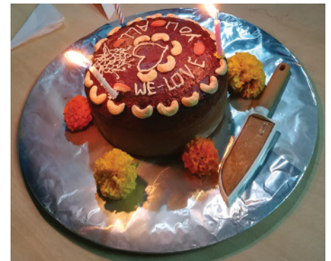
Cake baked by members of the village to thank the Rotarians for providing a hospital.

granted. Heartfelt thanks to all who are supporting the Mirge hospital project! ○