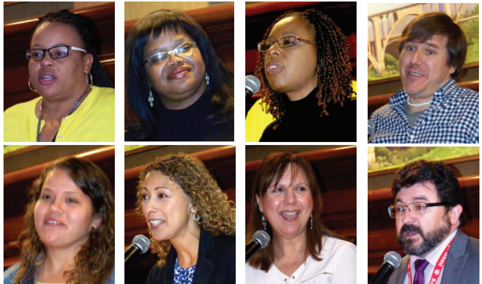
Please turn to Program, p.4