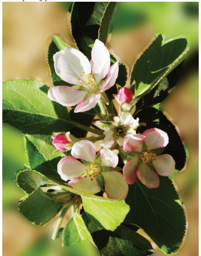
You might decide to love these apple blossoms and the fruit that follows.

Love is the master key that opens the gates of happiness.