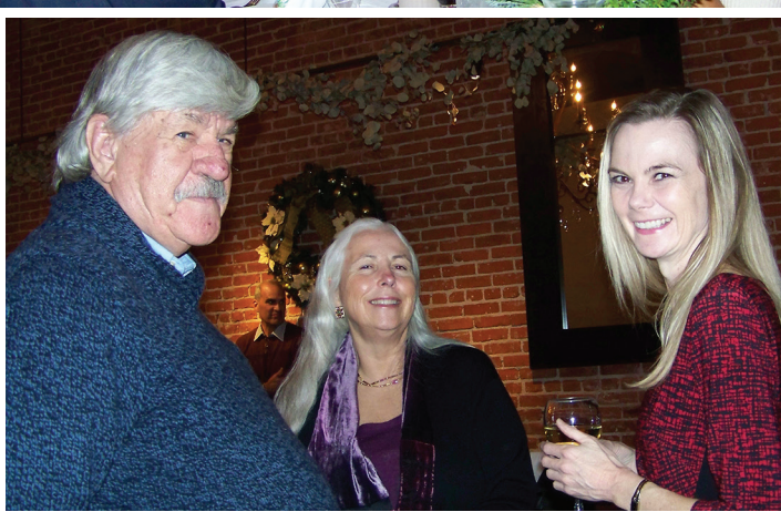
Find more pictures on p. 6