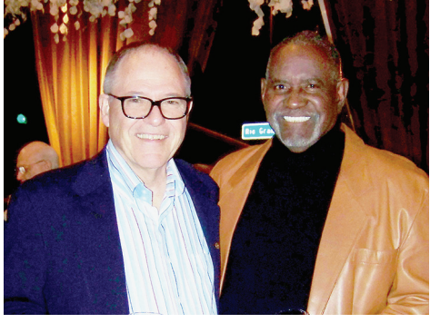
Find more pictures on p. 5