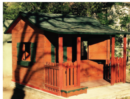
Sparks - Altadena Rotary Club Newsletter