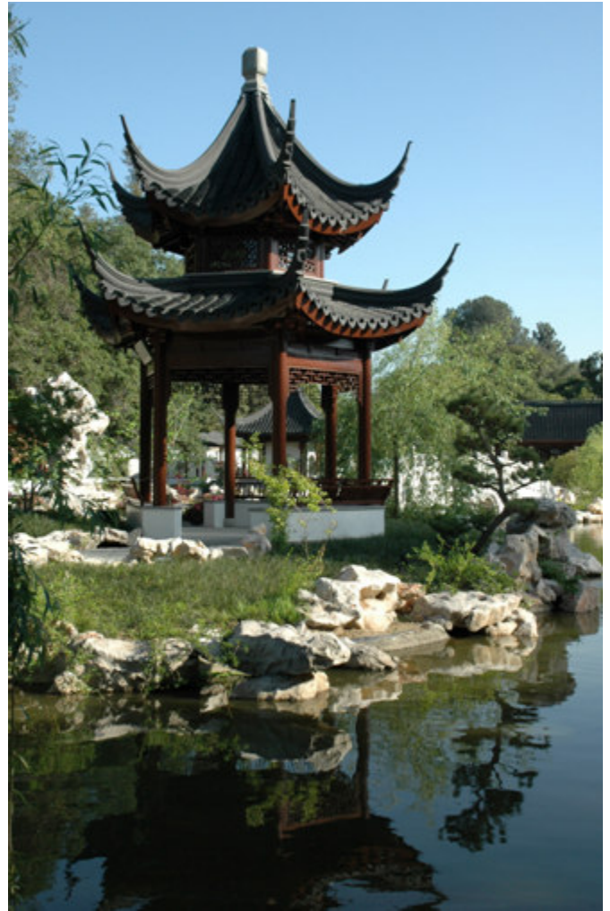
The Chinese Garden The Huntington Library and Gardens