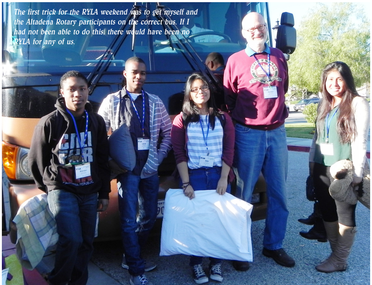
The first trick for the RYLA weekend was to get myself and the Altadena Rotary participants on the correct bus. If I had not been able to do this, there would have been no RYLA for any of us.

When I returned, I re-read the notes I'd taken beforehand. There were many suggested questions one was to ask whenever students turned to us for advice. Long