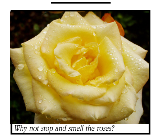
Sparks - Altadena Rotary Club Newsletter

I could go on but I have already used far more space than allotted to me for my President's message. Just thank you all for helping make the Rotary Club of Altadena the Treasure of the Foothills .