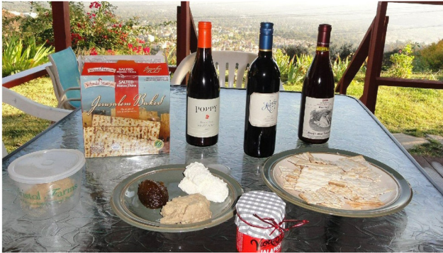
Meeting Fare: Cream Cheese, Chopped Liver, Chili Pepper Jelly, Matzo, Wine